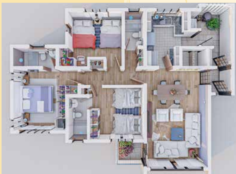
3BR FLOOR PLAN