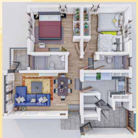
2BR FLOOR PLAN