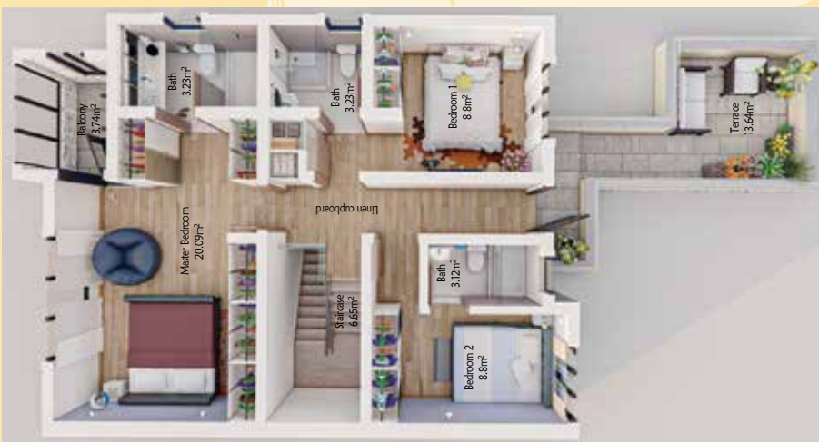
1 ST FLOOR PLAN