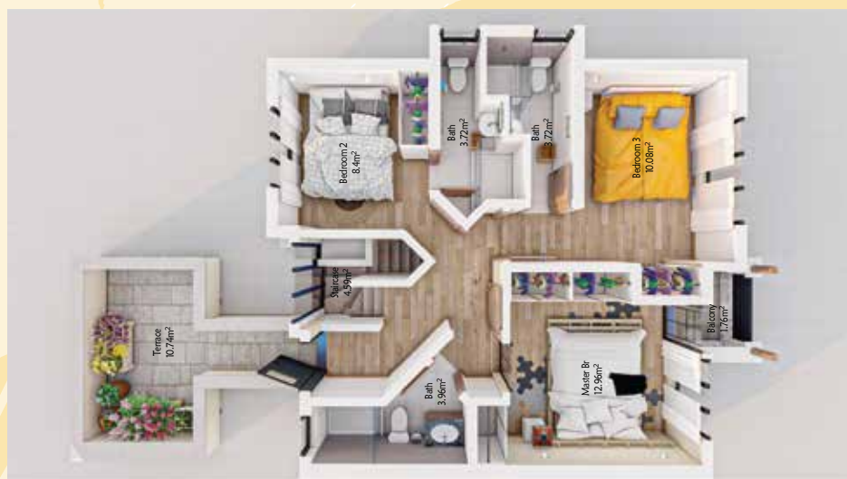
1 ST FLOOR PLAN