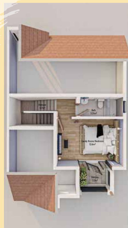
2 ND FLOOR PLAN