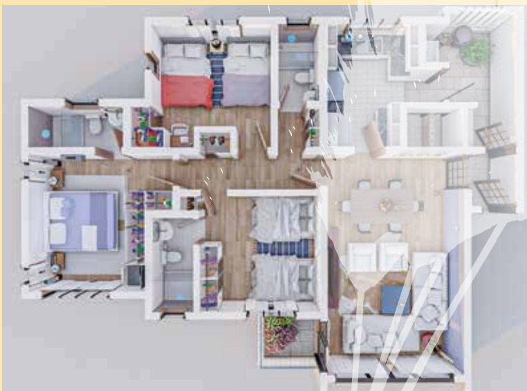
3BR FLOOR PLAN